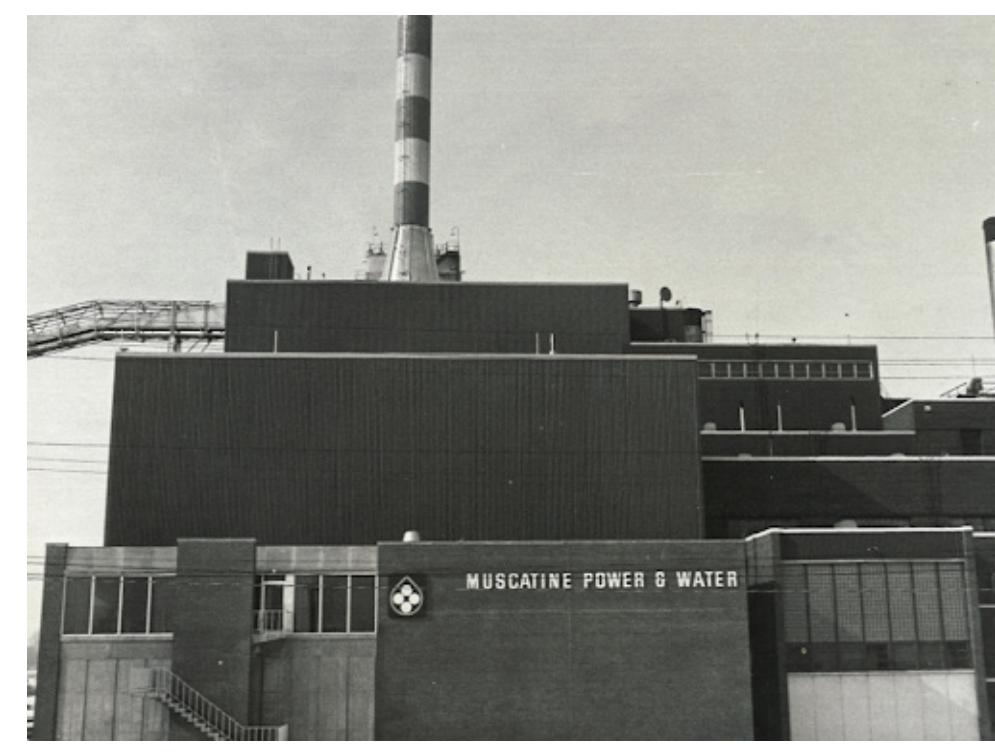
Founded over a century ago as the local municipal water utility, today Muscatine Power and Water is a full-service utility providing water, electric and communications services to Muscatine.

Small communities like McGregor must not be neglected in the clean energy transition and be provided the resources and personnel to achieve energy security along with the investor-owned utilities, cooperatives, and larger public power institutions. The Clayton County Energy District, part of the Clean Energy Districts of Iowa, has encouraged McGregor to increase adoption of rooftop solar and utilize the bluff top for larger scale solar, while improving energy efficiency and electrification rebate incentives.