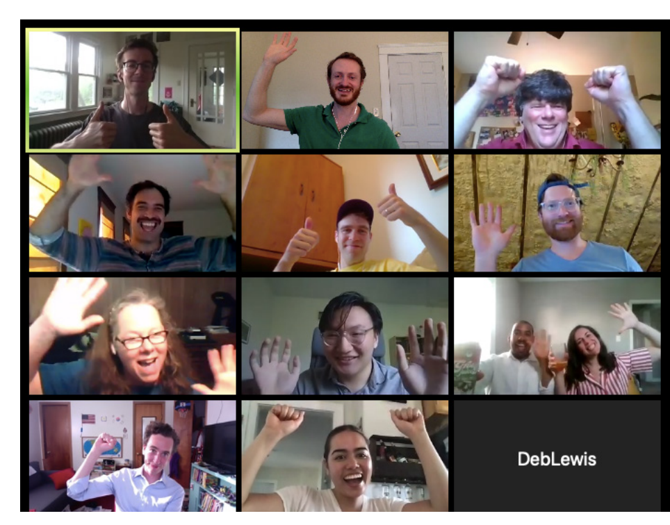
Members of the Cleveland Solar Cooperative ratifying bylaws on Zoom in 2020.

resolution by the City of Pontiac, Michigan, or even the development of a generation-only utility as with Cuyahoga County, Ohio, offers the benefits of scale and the ability to socialize costs and benefits better between highly impacted communities and more well-off communities. For the great majority of public utilities which may serve just hundreds of people, larger-scale public power institutions would allow them to access a larger expert workforce and capital for energy transition projects without needing to negotiate terms with investor-owned entities which don't share their motivations.